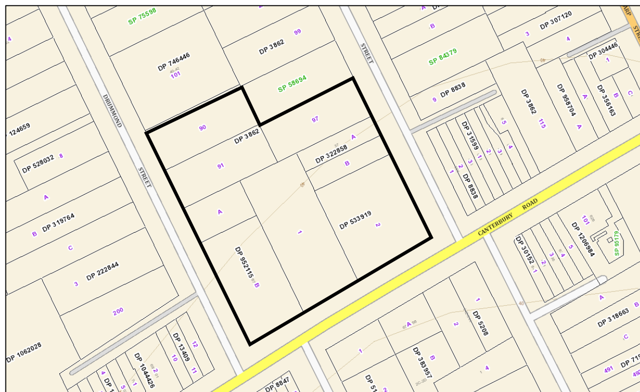
Figure 7: Site Description